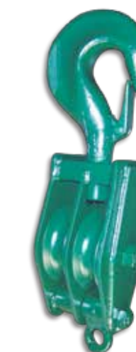
Tackle block with bucket