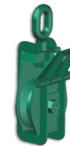
Return tackle block